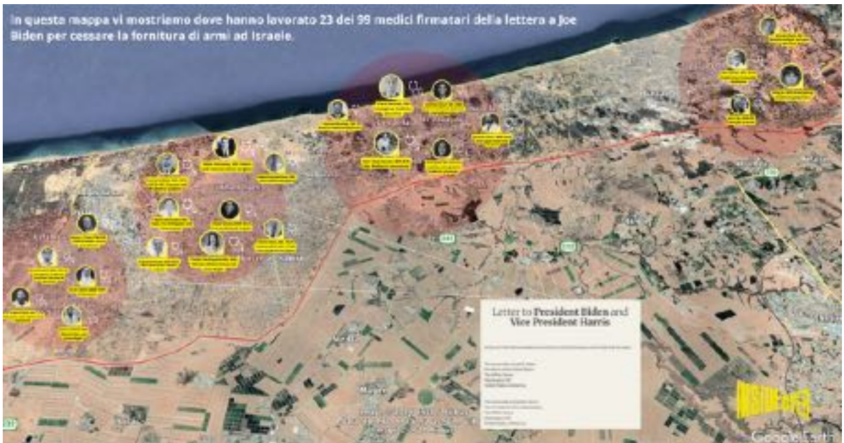
In questa mappa vi mostriamo dove hanno lavorato 23 dei 99 medici firmatari della lettera a Biden per cessare la fornitura di armi ad Israele